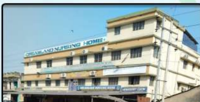
Dreamland Nursing Home

According to the course plan, the students will be given enough exposure to the clinical area. The clinical training facility have been arranged in Burdwan Medical College & Hospital (Affiliated by WBNC) and Dreamland Nursing Home (Parent Nursing with all the advanced facilities and specialists covering all departments like Medicine, surgery, gynecology, paediatrics etc. Selected field trips to Urban Primary Health Centre (Bananabagram BPHC) and Rural Primary Health Centre (Gushkara PHC) have been also be arranged for clinical practice.